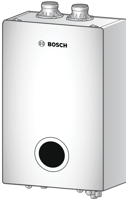
Bosch Singular 4000 Combi Boiler Bosch Singular 5200 Combi Boiler